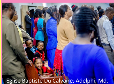
Eglise Baptiste Du Calvaire, Adelphi, Md.

Story: Up to 58,000 Haitians in the U.S. are TPS recipients. On Nov. 20th, they learned from the Dept. of Homeland Security that their protected status would be terminated effective July 22, 2019. One anonymous Haitian TPS recipient shared in the Washington Post how she came to the U.S. at age 18 on a visitor’s visa, has lived here more than 20 years, works as a nurse in Maryland, and has had TPS status since Haiti’s devastating 2010 earthquake. Now 40, the wife of another TPS recipient, and mother of a 2 year old, she deeply values her Adelphi, Md. Haitian congregation. Even though relatives in Canada ask her to come join them, she says, “I think it’s lack of faith for me to get up and leave.” At the same time, she knows that “If I go to Haiti, I would struggle to live. To take care of children would be hard....with no pure water. No shelter. No food. No house in Haiti.” But she continues, “If I leave children here, it will be family separation.”