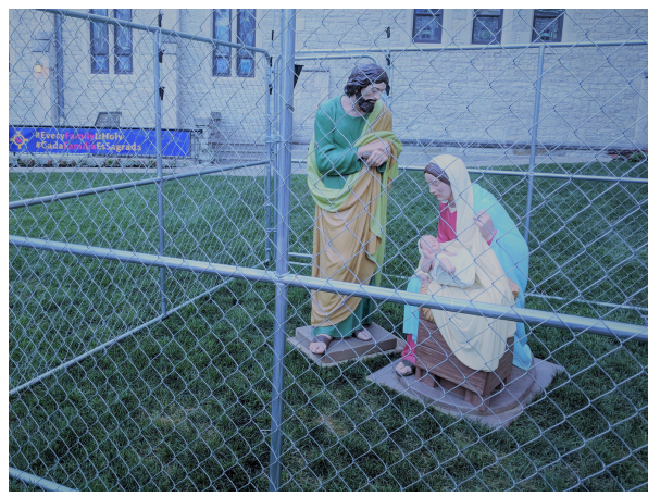
Christ Church Cathedral

We invite you to consider placing your tabletop nativity set inside a cage, surrounding it with wire, or making a large outdoor display with fencing to remember immigrant or refugee families now enduring detention and displacement. Be inspired by the display of Christ Church Cathedral, Indianapolis - installed since family separation began last summer! Images related to each devotion's theme are also provided on pages 20 and 21. Print these out on large mailing labels or other sticky paper to affix to your display in the first four weeks. Then place the images near your nativity on and following Christmas Eve, to help recall the daily challenges faced by migrants seeking hope. On Christmas Eve, be sure to remove any barrier around your nativity to celebrate the power of Christ's birth to overcome oppression.