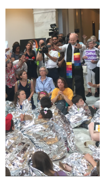
Faith leaders and children act and pray in Russell Senate Rotunda against family separation and detention.

Prayer - Loving Lord of Life, we pray for immigrant families in this moment who are detained, hungry, lonely, confused, and seeking hope. May you grant to them a vision of life beyond barriers, that they might truly experience a home again that offers safety beyond threats, hope beyond harm, and love beyond locked gates. And give any of us privileged to live freely the courage and will to do all we can to offer healing and end family detention. AMEN.